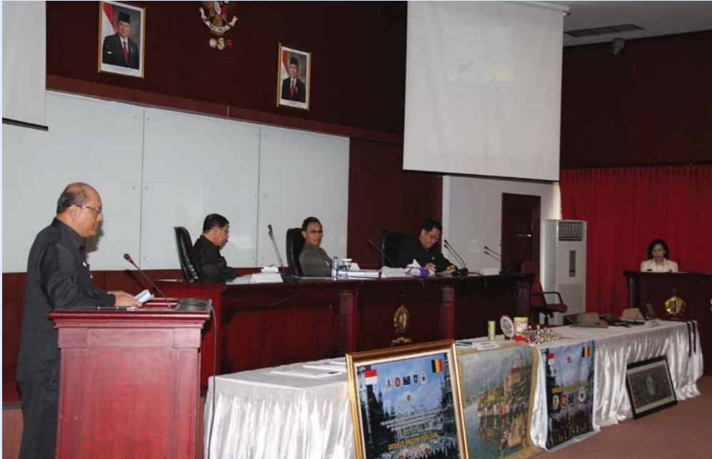
Heads of the entourage and groups of PPSA XVII participants that visited Australia for SSLN present a report to the Governor of Lemhannas RI.

that must be followed by participants of PPSA XVII of Lemhannas RI. All the four destination countries are the developed countries which have been considered to have a system and capability and play a strategic role in the prevention of acts of terrorism in three different continents that are tailored to the theme of education, namely: “Combating Terrorism within the Framework of National Defense” and the theme of the seminar “Preventing and Taking Measures against Acts of Terrorism in the Framework of National Resilience” .