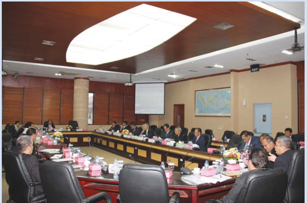
The roundtable discussion on the understanding of the values of diversity in the framework of the nation's unity on July 15, 2011 on the 3rd Floor of West Wing, Astagatra Building.

Governor of Lemhannas RI in his keynote speech conveyed that one of the pillars of the nation is the “Unity in Diversity” concept which means different, but united in unity. The diversity is implemented in the form of pluralism and multiculturalism. The pluralism is the condition of Indonesian nation that is characterized by the presence of various tribes, races, religions, languages, customs, and so forth. Pluralism assumes the existence of diversity, difference, or pluralism. However, the diversity in the pluralism is currently seen only on quantitative terms, pluralism has yet