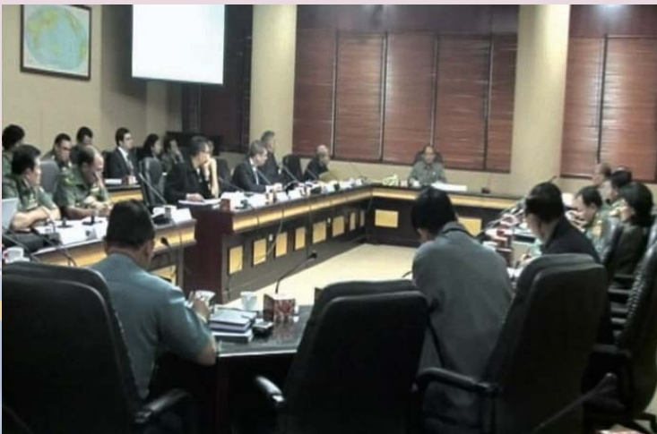
An evaluation meeting on the program and budget implementation led by Governor of Lemhannas RI on the 3rd Floor of West Wing of Astagatra building

Sixth , for the First Secretary of Lemhannas RI as the authorized budget holder (KPA), with continuous support from the Bureau of Planning and Finance, to continuously carry out a control over the implementation of both the activities and budget realization while adhering to outputs and outcomes of each activity.