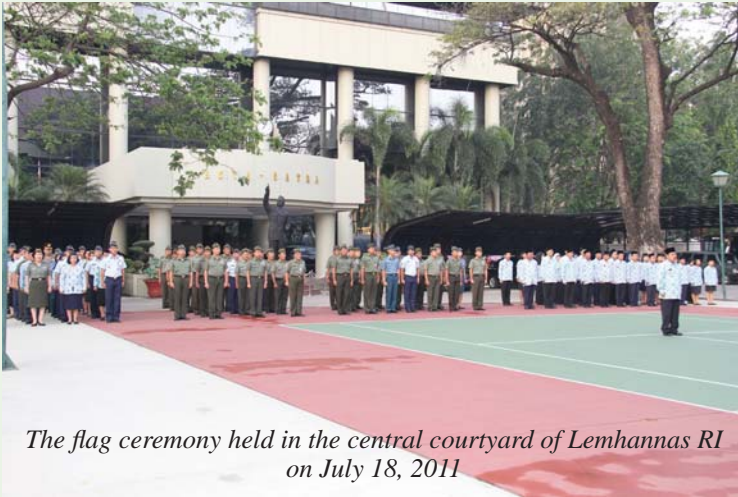
The flag ceremony held in the central courtyard of Lemhannas RI on July 18, 2011

G overnor of Lemhannas RI delivered a speech at a monthly flag ceremony on July 18, 2011 in the central courtyard of Lemhannas RI. Also present at the event was the secretary of the governing board, first secretary, deputies, structural officials, expert lecturer, expert analysts, expert professionals, PPSA XVII participants and PPRA XLVI participants of Lemhannas RI.