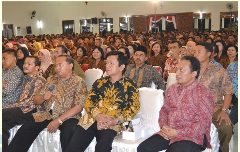
National Workshop "Pancasila Education in School Curriculum," held in Karanganyar, Central Java.

Therefore, it is only with a struggle that this nation can prove to the others that the spirit of mutual cooperation can realize religious-socialism, and prove that Pancasila, which is the philosophy of the nation, will remain relevant over time. Therefore, Governor of Lemhannas RI called on all the attendees to enliven the spirit embodied in the Pancasila, as well as the spirit of mutual assistance.