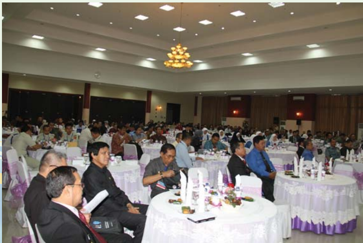
A situation of national seminar “Actualization of Pancasila Values as the Solution and Identity of the Nation on June 22, 2011 in Lemhannas RI