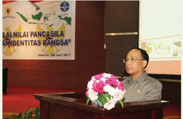
Governor of Lemhannas RI Prof. Dr. Ir. Budi Susilo Soepandji, D.E.A. delivers a keynote speech in the national seminar held in Dwiwarna Purwa Building, Lemhannas RI

The national seminar aimed to discuss what and how an idea about actualization of the values of Pancasila can serve as the national solution and identity. The national seminar is expected to provide input to stakeholders to agree and establish the position of Pancasila as the source of value, the solution of problems and national identity. In addition, this seminar is expected to also serve as an entry point for further discussion in the national workshop and produce a policy paper and work plan for the implementation.