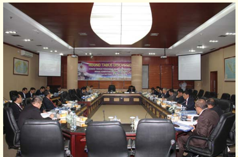
Roundtable discussion on Understanding the Values of the 1945 Constitution of the Republic of Indonesia

It is expected that with the convening of the roundtable discussion, the results of the research on understanding the values of the 1945 Constitution of the Republic of Indonesia will improve. It is because the results of the research will serve as the guidelines for all parties involved in the socialization activities for the implementation of the values of the 1945 Constitution, thus getting maximum and appropriate results, well targeted and sustainable programs, which will be followed up by subsequent programs. In addition, this research is also an effort to cultivate the values of the Constitution and the integrated, comprehensive and coordinated national system.