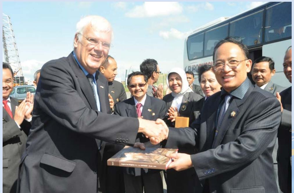
Governor of Lemhannas RI receives book souvenirs during a visit to Port of Antwerp, Belgium for SSLN of PPSA XVII 2011

Institution, RAND Corporation, and the American Enterprise Institute for Public Policy Research, while in Belgium, Lemhannas RI governor and his entourage visited the Embassy to Belgium, the Port of Antwerp, the