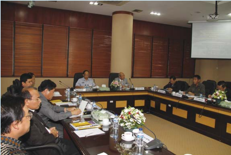
Acting Deputy for the Consolidation of National Values of Lemhannas RI reports to the Governor of Lemhannas RI regarding the roundtable discussion activity.