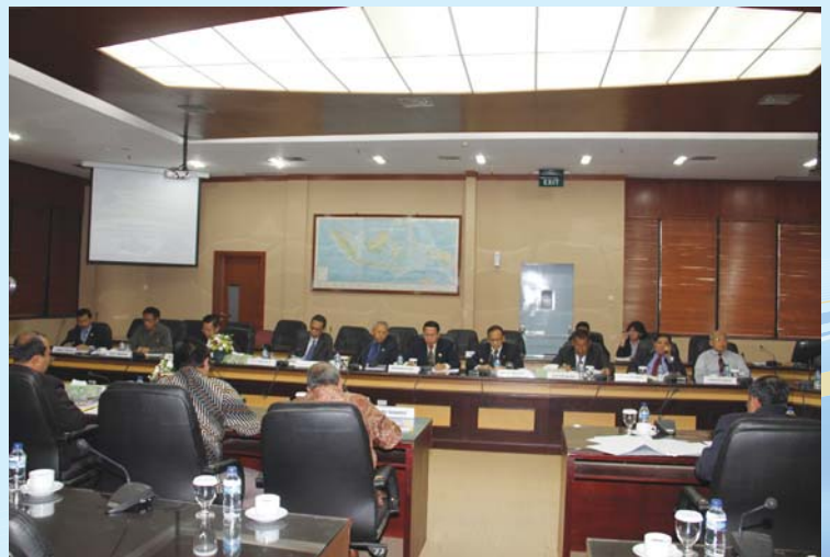
The roundtable discussion on the consolidation of the values of the unitary state of the Republic of Indonesia held on the 3rd Floor of West Wing, Astagatra Building, Lemhannas RI on July 12, 2011.

Currently, Indonesia is facing a lack of commitment to a sense of Indonesian nationhood, fading ethics, lack of honesty, less trustworthy, the attack of foreign culture on local culture, primordialism, and narrow fanaticism. With the convening of the roundtable discussion, it is expected to address the challenges facing the nation while maintaining a sense of unity. Knowledge regarding the understanding of national values is very important especially in border areas, as mentioned by the President of the Republic of Indonesia Dr. Susilo Bambang Yudhoyono that the border areas should serve as “the country’s porch instead of backyard”.