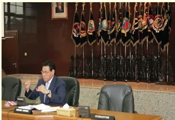
Governor of Lemhannas RI delivers speech before participants of Sespati Polri at the Police Headquarter