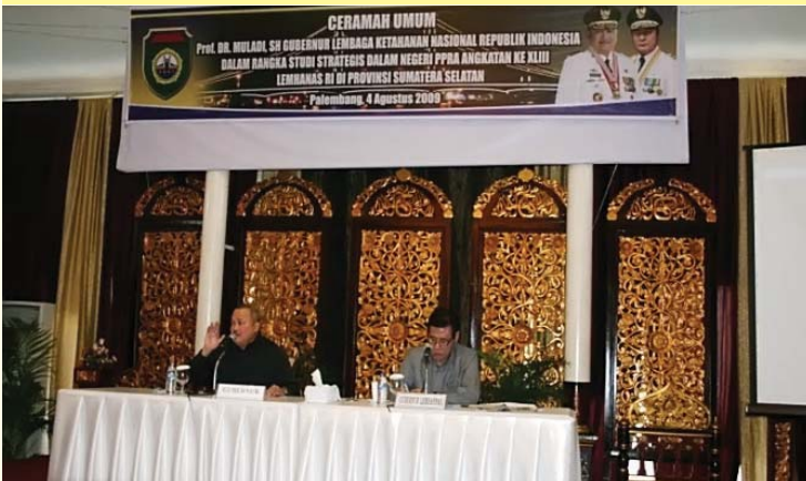
The Governor of Lemhannas RI addressed general speech in terms of SSDN in South Sumatera Province

completely and integrally based on constitution, national insight and national resilience issues in terms of national development as well as performing strategic research, both reactive and anticipative (scenario building).