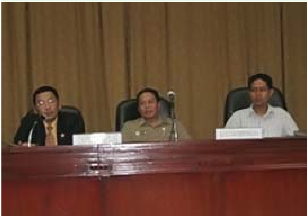
Speech from Deputy National Values Consolidation representing Lemhannas RI Governor on students of Paramadina University provisioning