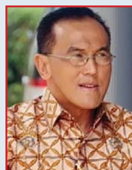
Ir. Aburizal Bakrie Member