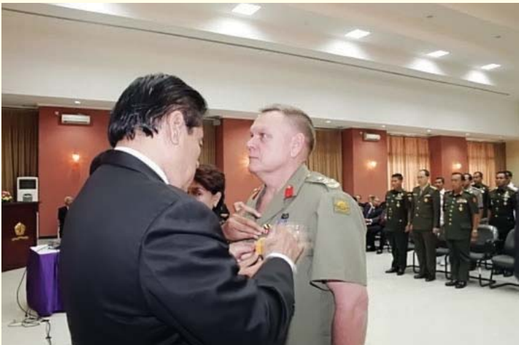
PPRA XLIII participant ID affixing to the representatives of foreign students by the Governor of Lemhannas RI