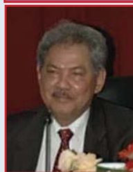
Prof. Drs. HA. Malik Fadjar Member