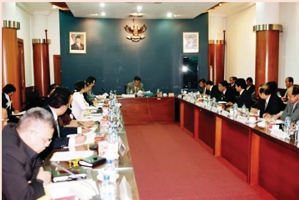
Keynote Speech of Lemhannas RI Governor at RTD event in Nusantara room on August 6, 2009