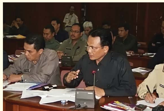
Discussion and FAQ between participants of Sespati and Governor of Lemhannas RI.

Recalling that one of statesman characteristics is universal recognition to his/her monumental works, then a national leader has to courageously fight for values contained in national insight in constructing or contributing the creation of "Globally Shared Values, Norms and Standards," as well as has to be able to convince the world that Indonesian national insight is not merely a particularistic element, but also a sub-system of universal and religious values. (Note: Bung Karno once delivered a speech before General Assembly of the UN on June 1, 1965, which introduced Indonesian National Insight, entitled "To Build the World a New").