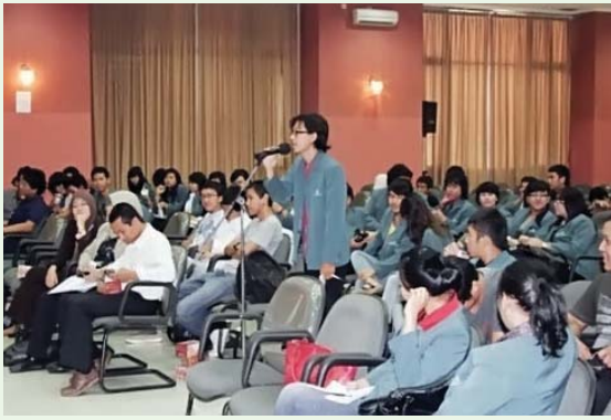
Atmosphere of Q&A of the students of Paramadina University in Dwiwarna Purwa Building Lemhannas RI

Pancasila Ideology values, 1945 Basic Laws, Bhineka Tunggal Ika Senses, and NKRI basic that go on dialogist and not monologist.