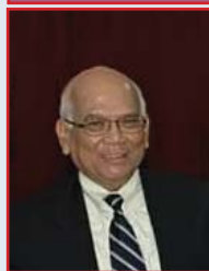
Prof. DR. Dorodjatun Kurnojrakti Member