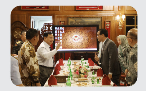
The Governor of Lemhannas RI pays a Courtesy Call to the Minister of Defense of the Republic of Indonesia