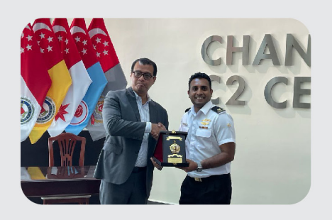
PPRA 65 Conducts an Overseas Strategic Study