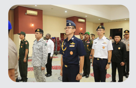
Inauguration of the PPRA Senate Management 65