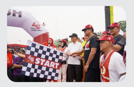
Commemorating 45<sup>th</sup> Anniversary, IKAL Lemhannas RI Holds Nusantara Fun Walk