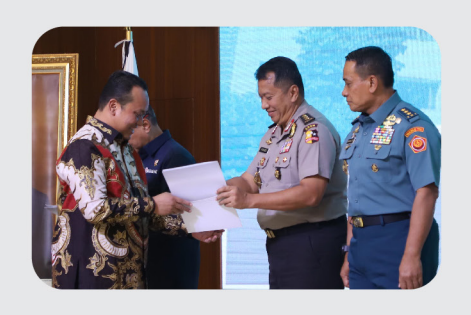
Lemhannas RI is Committed to Presenting a Clean and Accountable Bureaucracy