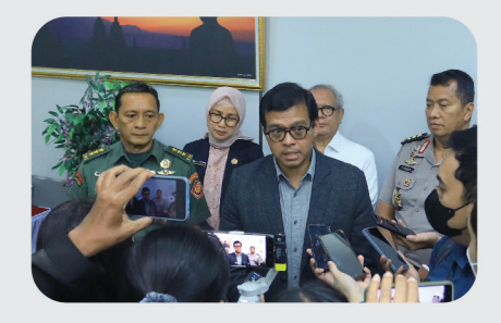
End of Year Statement 2022 Governor of Lemhannas RI