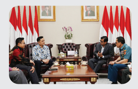
The Governor of Lemhannas RI Receives a Courtesy Call from the Head of BPKH