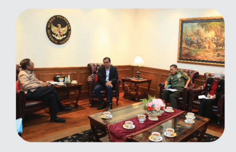
Governor of Lemhannas RI visited Kemenko Polhukam RI