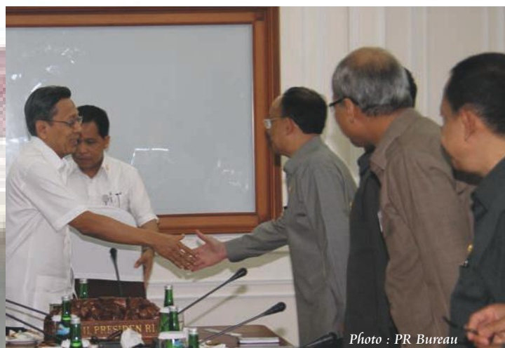
The Vice President of the Republic of Indonesia receives the governor of Lemhannas RI and his and his staff in a consultative meeting at the Vice Presidential Palace in Jakarta

On the occasion, the governor gave a presentation on the problems faced by Lemhannas RI and its future Strategic Plan (Renstra). "The today's meeting is very important for us, as it will give us an idea of the things that we need to carry out", said the governor in the meeting room of the vice president in Jakarta.