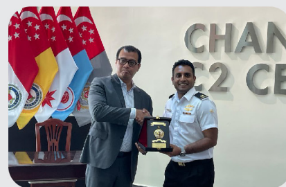
PPRA 65 Conducts an Overseas Strategic Study