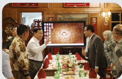
The Governor of Lemhannas RI pays a Courtesy Call to the Minister of Defense of the Republic of Indonesia