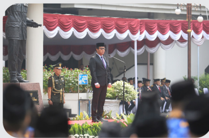
Commemorating its 58th Anniversary, Lemhannas RI Holds a Ceremony and celebration