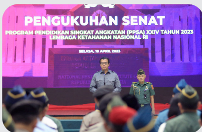
Three Directives from the Governor of Lemhannas RI at the Inauguration of the PPSA 24 Senate