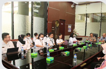
Final Briefing of BPK RI Examination on Lemhannas RI's Financial Statements Fiscal Year 2022