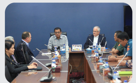
Visit of USIP's Delegation to Lemhannas RI