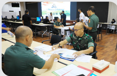
PPRA 65 Candidates Completing Reregistration Process