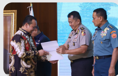
Lemhannas RI is Committed to Presenting a Clean and Accountable Bureaucracy