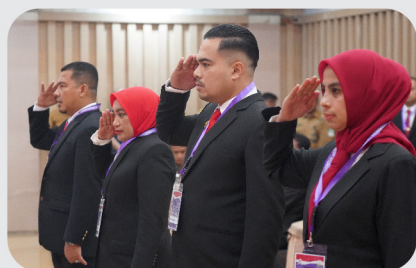
Strengthening of National Values Program in Aceh