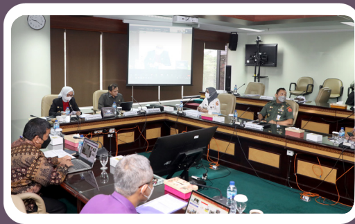
FGD on Fertilizer Crisis Anticipation Strategy