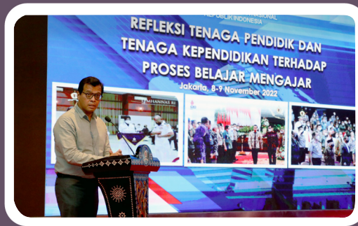
Directives from Lemhannas RI's Governor on the Event of Reflections of Educators and Educational Staffs