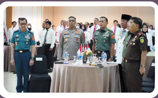
Dialogue on National Outlooks in Bengkulu Province