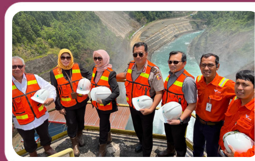
Lemhannas RI's Study Team Heads to Sorowako to Deepen Their Study