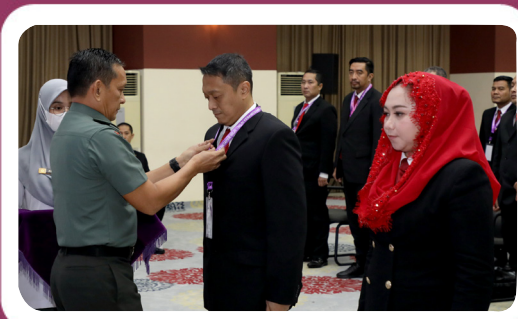
Strengthening of National Values Program for the Management and Members of Japnas