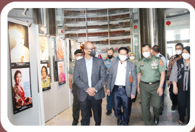
The Governor of Lemhannas RI Visits the National Library of Indonesia