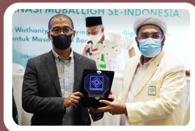
The Governor of Lemhannas RI as a Speaker at the Bakomubin National Conference