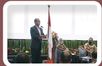
The Governor of Lemhannas RI Attends the Air Force Executive Meetings