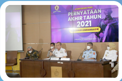
Lemhannas RI's Year-End Statement of 2021 Highlights National Dynamics and Challenges