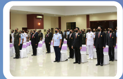
Regular Education Program Batch 63 Officially Started