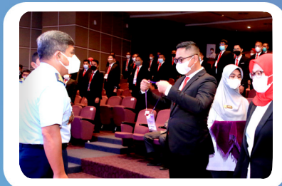
Acting Governor of Lemhannas RI Opens Strengthening of National Values Program for ToBe Institute Alumni