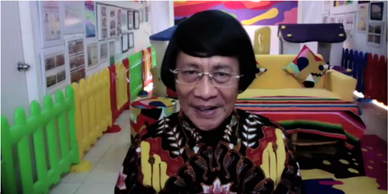
Wed, August 4 th 2021