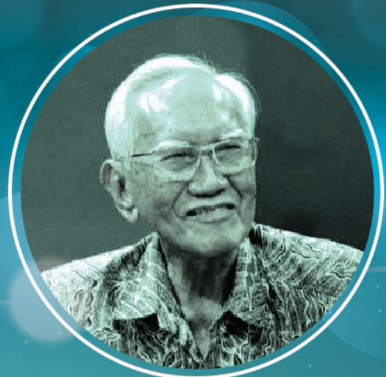
LETJEN TNI (PURN) SAYIDIMAN SURYOHADIPROJO

Governor of Lemhannas RI for 2005 - 2011 period