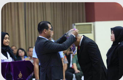
ITB Alumni Association and BPJS Ketenagakerjaan Participates in the Strengthening of National Values Program at Lemhannas RI