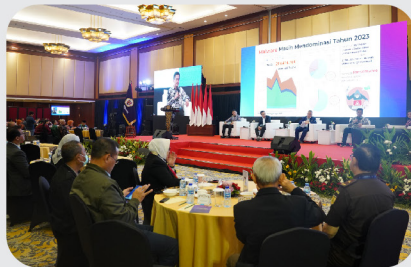
National Seminar on Digital Transformation of Indonesia 2045