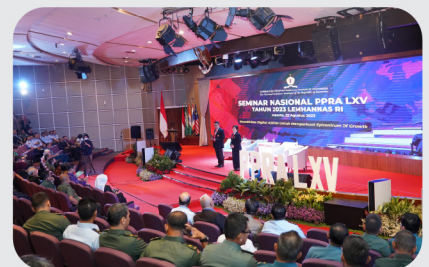
PPRA 65 of Lemhannas RI Hold National Seminar to Advocate ASEAN Connectivity