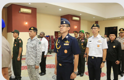
Inauguration of the PPRA Senate Management 65