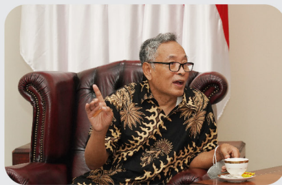
Center for National Security Studies' Courtesy Call