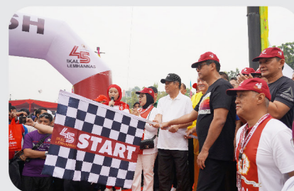
Commemorating 45 th Anniversary, IKAL Lemhannas RI Holds Nusantara Fun Walk