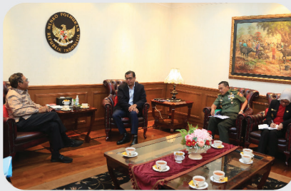
Governor of Lemhannas RI visited Kemenko Polhukam RI