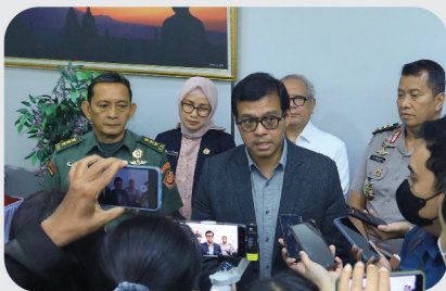
End of Year Statement 2022 Governor of Lemhannas RI