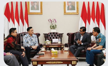
The Governor of Lemhannas RI Receives a Courtesy Call from the Head of BPKH