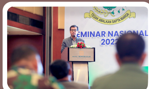
Governor of Lemhannas RI: Indonesia has much experience in Disaster Relief