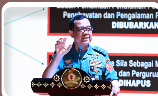
Socialization of National Values for All Lemhannas RI Personnel