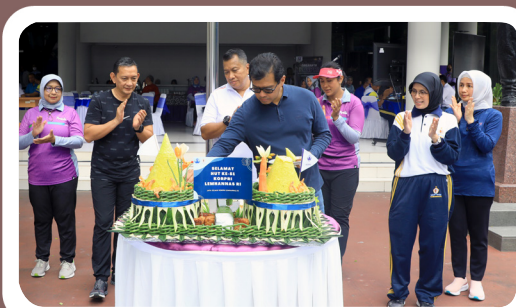
Lemhannas RI Celebrates Korpri's 51 st Anniversary