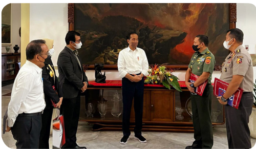
Lemhannas RI Receives Directives from President Joko Widodo

Commemorating the 77th Independence Day of the Republic of Indonesia, Lemhannas RI Working Together to Help Indonesia Recover Faster, Rise Stronger