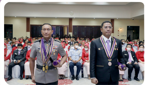
PPRA 63 is Officially Closed