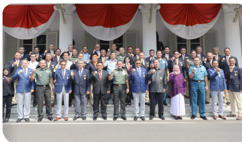
National Resilience College of Malaysia Visits Lemhannas RI