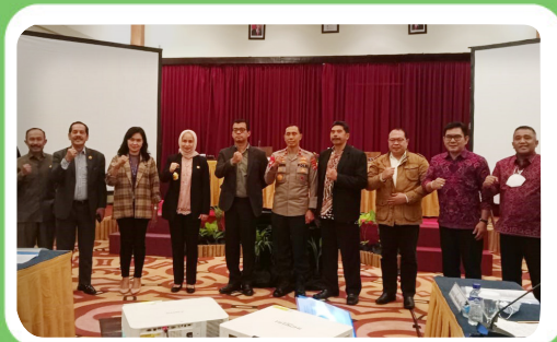
FGD on Strengthening Transnational Ideology in the Democratic Consolidation Process