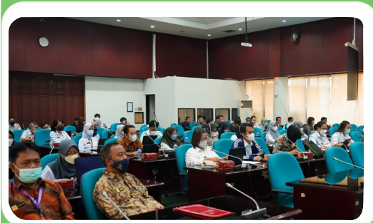
Socialization of Srikandi Application to support G2G