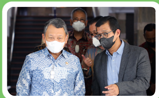
Governor of Lemhannas RI Visits the Ministry of Energy and Mineral Resources