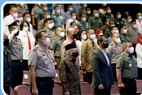
Public Lecture by K.H. Ma'ruf Amin