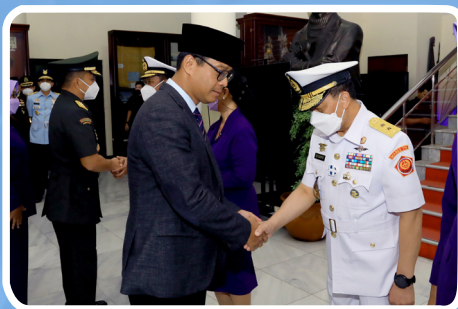
Handover of Duties of Deputy for Strengthening of National Values