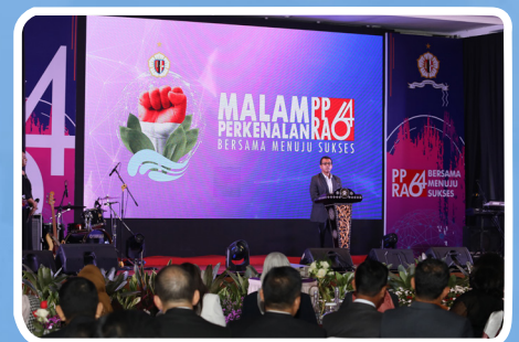
PPRA 64's Welcoming Night